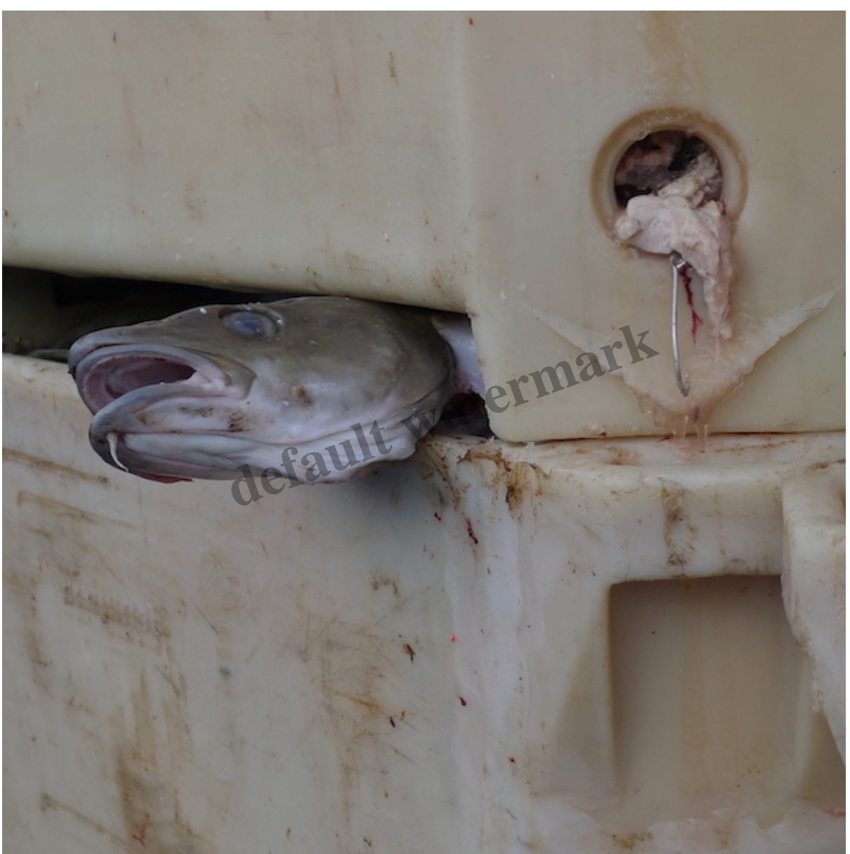
One that didn't get away